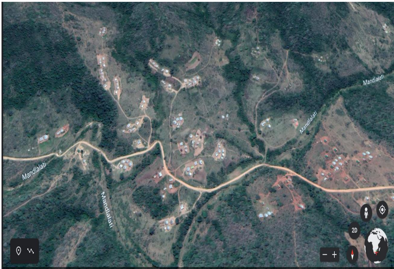
Figure 1: Locality of Mandlalathi Area (Ward 2), Umdoni Local Municipality Coordinates (30° 08' 41" S 30° 33' 48" E)

The proposed scope of works would be applicable, on varying scales, Mandlalathi, as indicated in Figure 1 below.