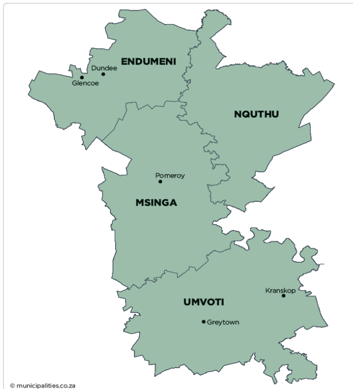
Figure 2: Locality Map for uMzinyathi District

The targeted area falls under the jurisdiction of Nquthu LM in uMzinyathi District Municipality. The Locality Map for uMzinyathi District is shown in Figure 2 below.